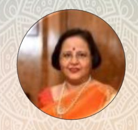
Amb. Ruchi Ghanashyam Former High Commissioner of India to UK, South Africa & Ghana